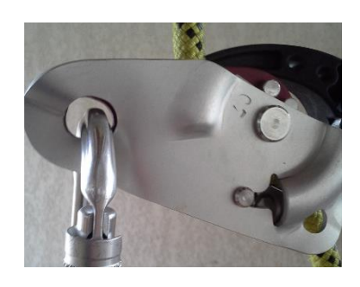
3° You can hang on.

Open and pull the handle if you want to descend.